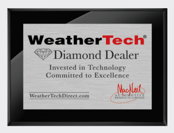
Diamond Dealer Plaque